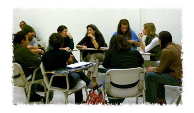
The AIR Program is made possible through funding by the Administration for Native Americans